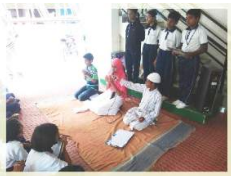
Fist of Rice