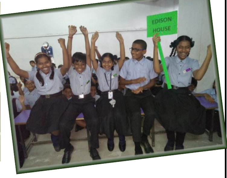
I feel July & August are achiever months for Voxpop as our students proved themselves in Sports, Arts, & Literature at Zonal, District & State level