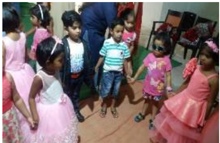
Pre-primary, Primary, middle & high school students participated enthusiastically in field trips which helped them to develop listening & Communication skills, raise self-awareness and sense of social responsibility.